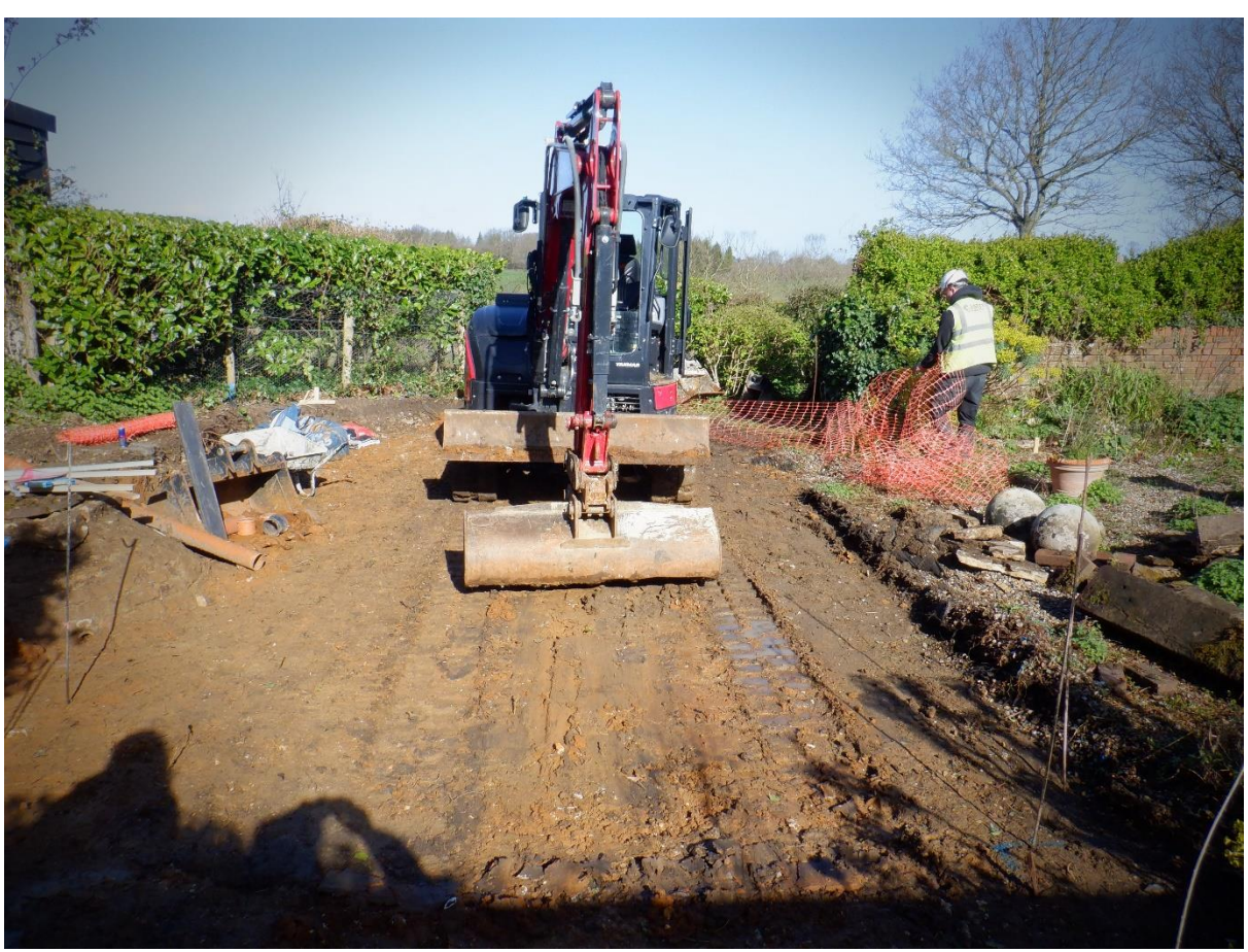
Plate 1. View of the site with clearance of the topsoil (looking NW)