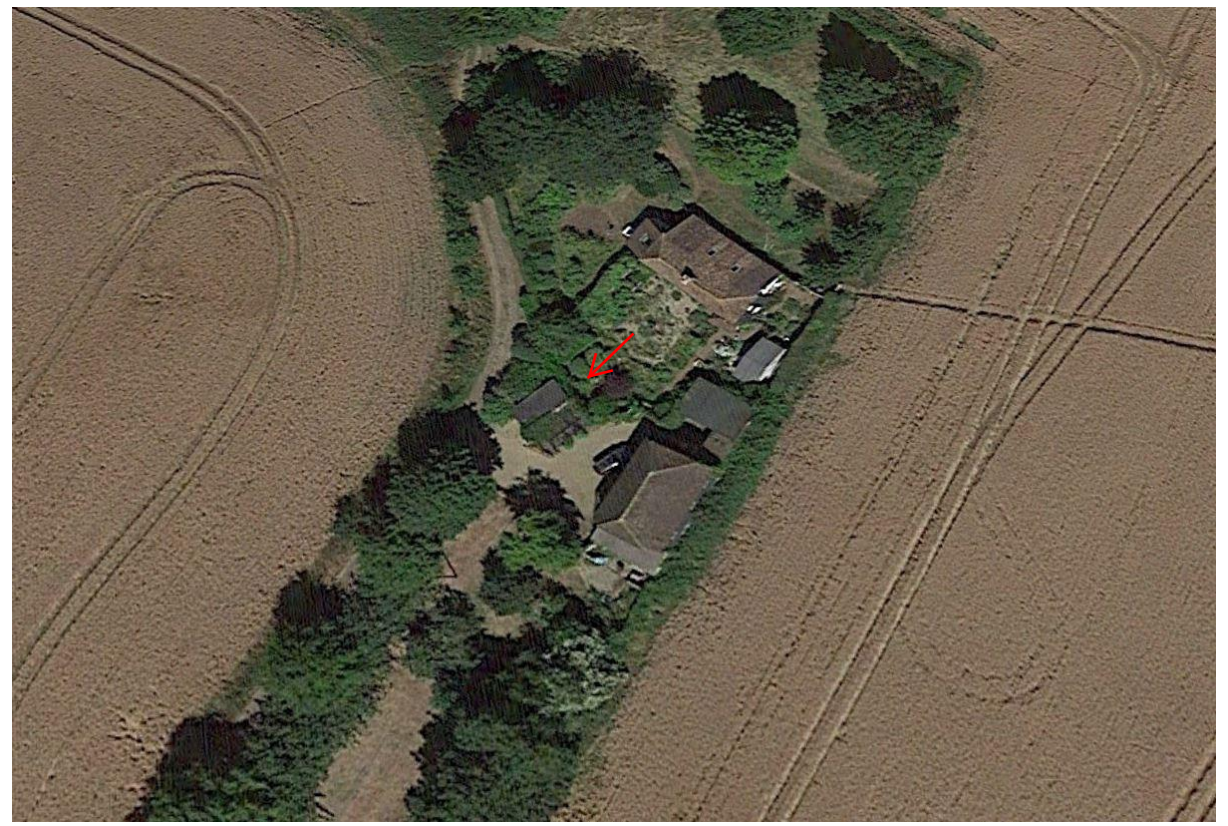
AP 1. View of site of proposed swimming pool -red arrow