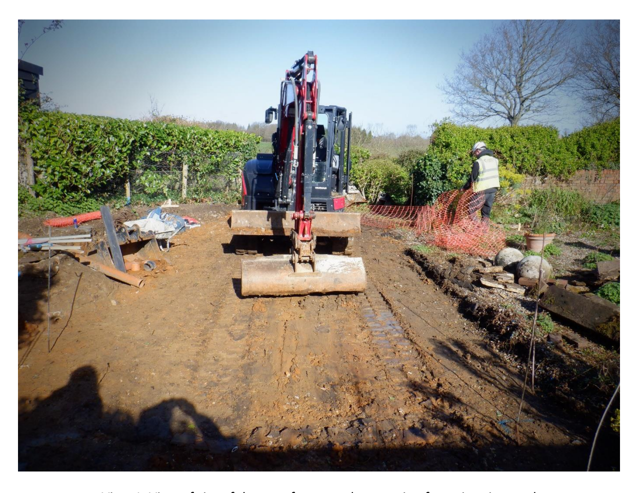
View 1. View of site of the area for ground excavation for swimming pool