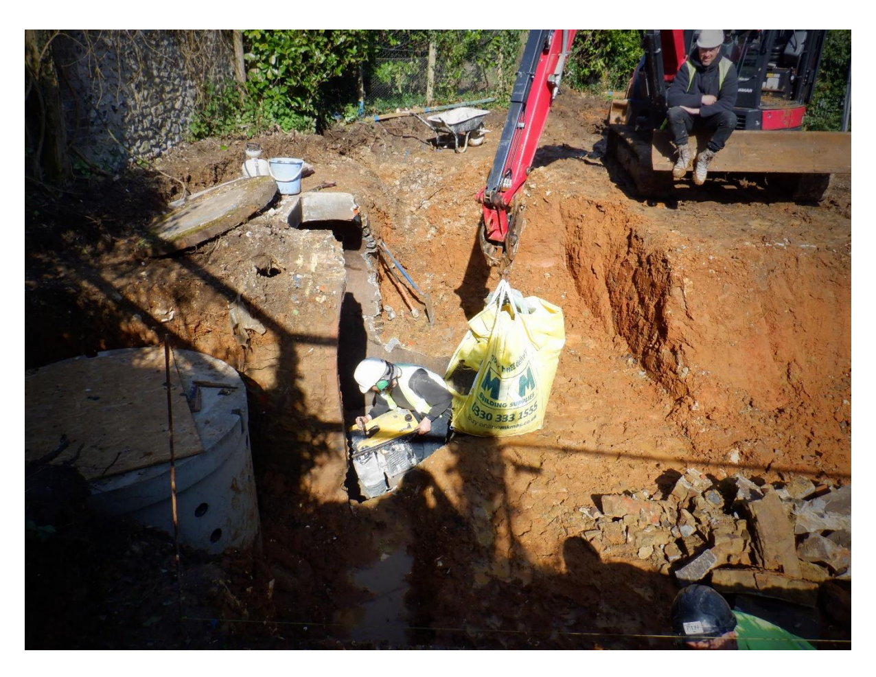
Plate 4. View of the swimming pool excavations and drain facility (looking SE)