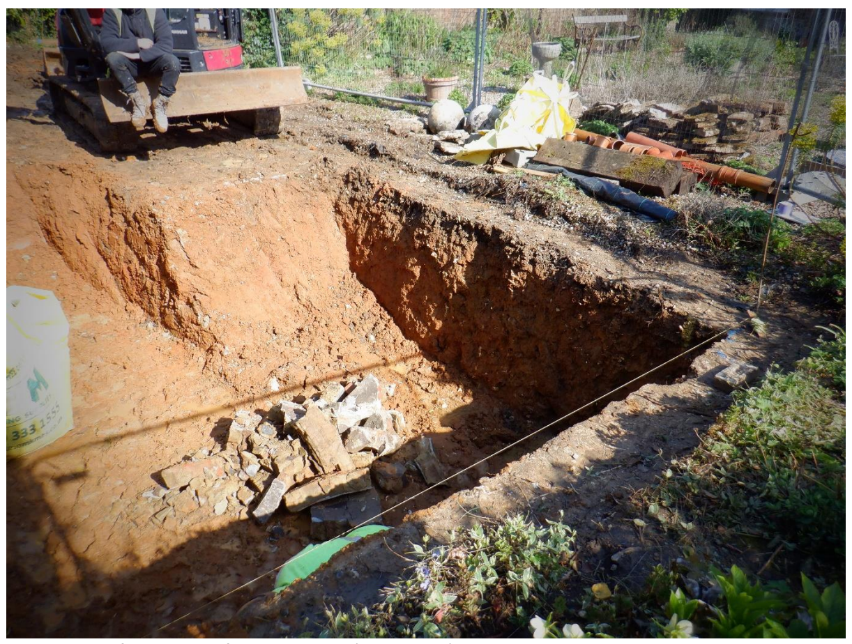
Plate 3. View of excavation of swimming pool (looking ENE)