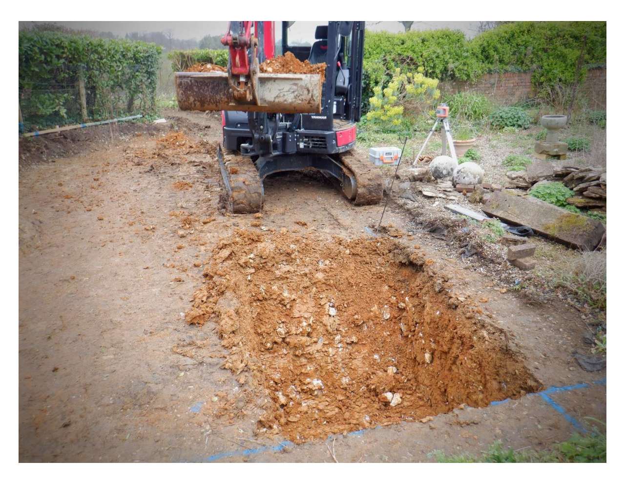
Plate 2. View of the initial section (looking NE)