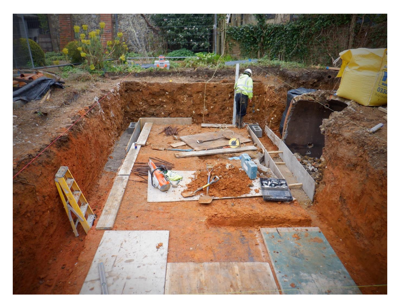
Plate 6. Completed excavations (looking SE)