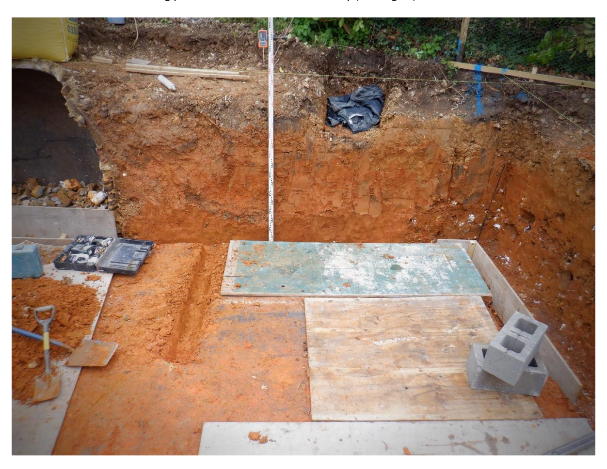
Plate 5. View of eastern section (facing SSW)